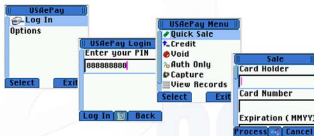
Above shows the process of logging in as well as accessing the Sale portion of the easy-to-use Wireless ePay program which installs on J2ME supported phones on any network.

The software also supports Address Verification System (AVS) and Card Verification Value (CVV) for your Mail Order / Telephone Order or Internet merchants or for those merchants who don't use the cradle for swiping the card for the transactions.